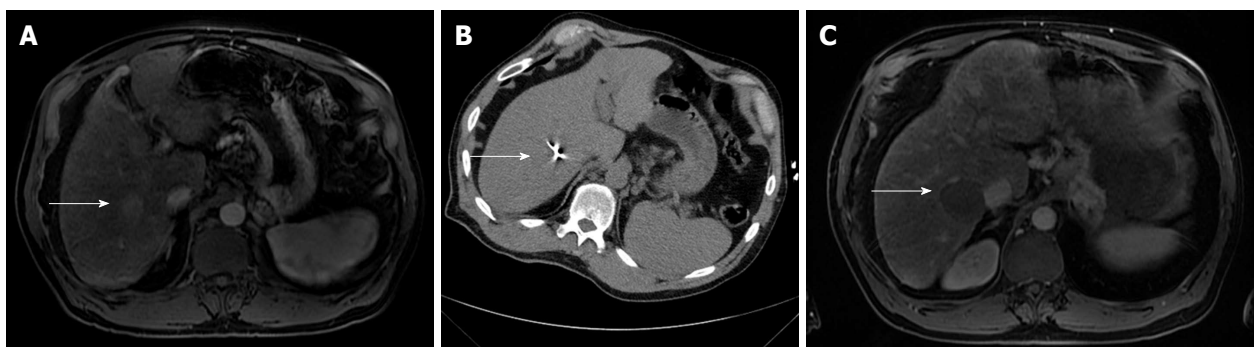
Figure 3 Sixty-two-year-old with hepatitis C cirrhosis. A: MRI shows an arterial enhancing lesion consistent with hepatocellular carcinoma; B: CT guided microwave ablation of the right hepatic lobe lesion; C: MRI shows an ablation zone and no evidence of residual tumor. MRI: Magnetic resonance imaging; CT: Computed tomography.

(Figure 3). This results in markedly increased kinetic energy and subsequent tissue heating [21] . Tissues with a larger concentration of water, such as tumors, are particularly susceptible to microwave heating [21] .