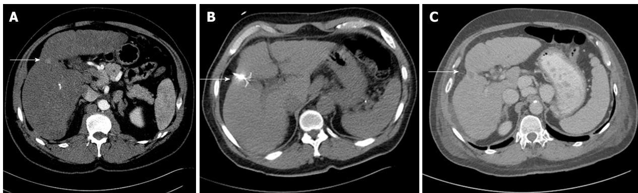
Figure 1 Sixty-eight-year-old male with hepatitis C and cirrhosis. A: Contrast enhanced CT shows a 16 mm HCC; B: RFA probe covering the lesion; C: Post contrast follow up CT shows capsular retraction at the site of the RFA and no residual tumor. HCC: Hepatocellular carcinoma; RFA: Radiofrequency ablation; CT: Computed tomography.

This review focuses on the use of percutaneous ablative techniques in the treatment of HCC, as well as of metastatic disease from colorectal, neuroendocrine, and breast carcinomas.